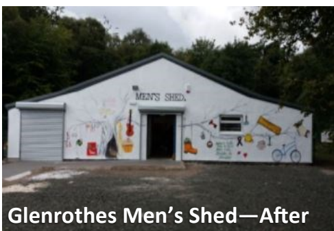
Glenrothes Men's Shed—After