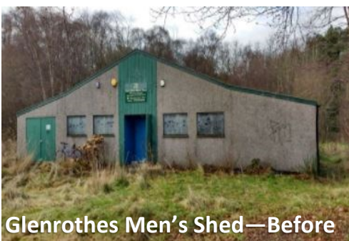
Glenrothes Men's Shed—Before