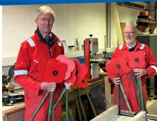
Pictured: Arbroath Men's Shed created this beautiful Remembrance Day tribute (left) whilst Banchory and District Men's Shed crafted wooden poppies (right) with half of the proceeds donated to the Legion Scotland Poppy Appeal.