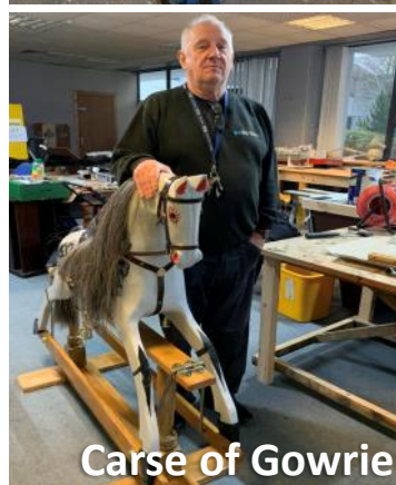
Carse of Gowrie