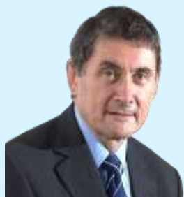
Sir Harry Burns PATRON